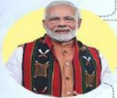
Hon. Prime Minister Shri Narendra Modi