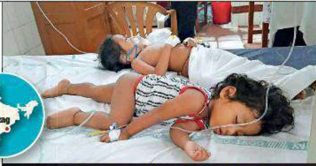
Children being treated at King George Hospital in Vizag