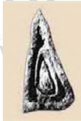
, Nj Nghdw fy;rkfhyj i j a toghl Lj j yk;