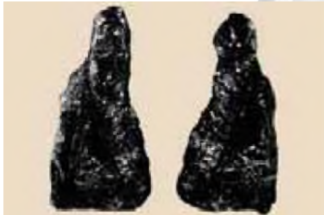
KfNfhz tbttyhd fwfs:Nky; goqfwfhy toghl Lj j yk;

Nky; goqfwfhyj i j r; Nruej xU toghl Lj j ykhf , Uej pUffyhk; vd fUj j Fej xU rW fl l khdk; c j j uggpuNj r j j py; c s s ghNfhu; vdDkpl j j py; mi lahsk; fhz ggl LssJ. nrJffgg l h j f w f s h y; t l l t b t p y; # o g g l i x U k z w g h i w a p d; g h s k; , q F f h z g g L f w J. , J j w f h y t o g h l L j j y q f i s x j j p U f f w J. , e j p a h t p y; t o g h l L j j y q f S f f h d N j l y p y; f i l j j k p f g; g o i k a h d r h d W , J j h d;