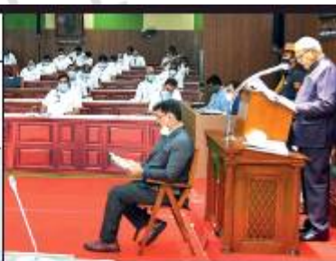
Rapt Audience: Governor Banwarilal Purohit addresses the assembly on Tuesday

➤ Fresh additional capital of ₹1,000cr over three years to TIIIC to expand