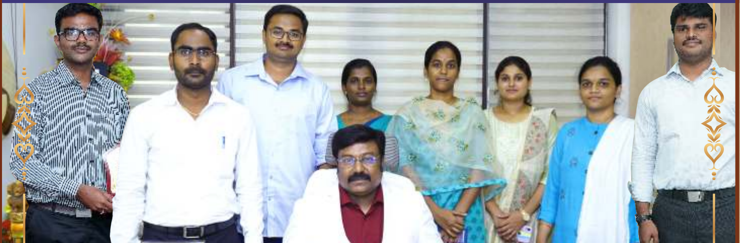
CONGRATULATIONS TO ALL DSP'S FROM APPOLO STUDY CENTRE

JOIN APPOLO TO JOIN THE PRESTIGIOUS STATE SERVICES