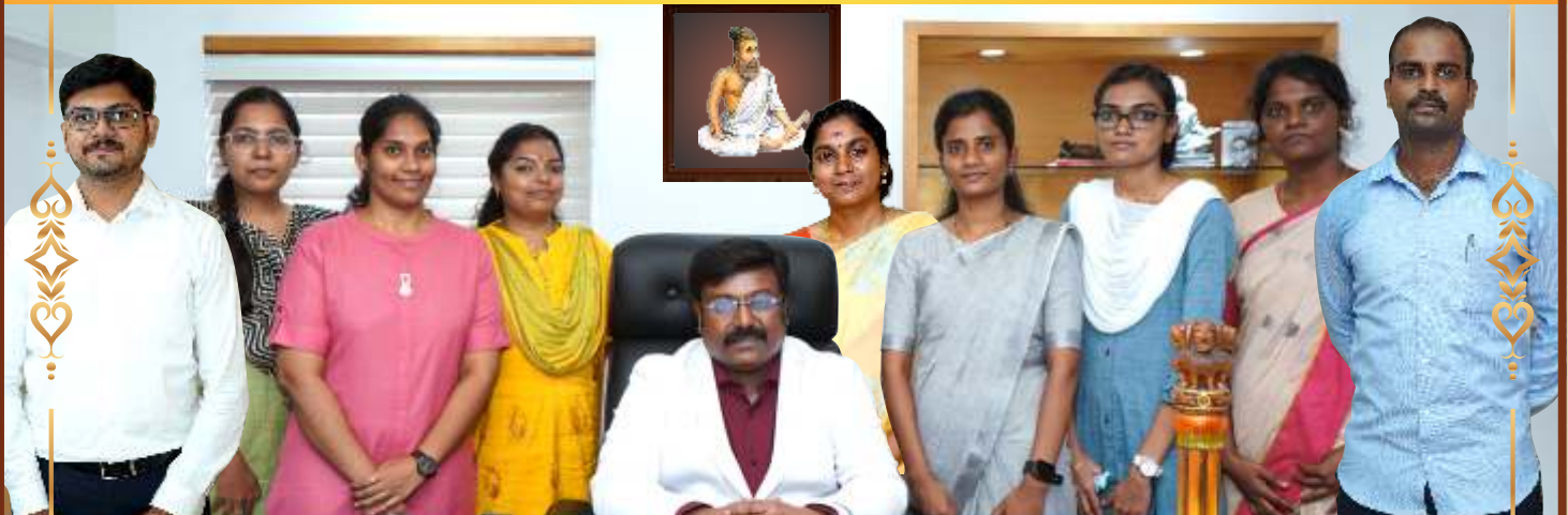
CONGRATULATIONS TO DEPUTY COLLECTORS FROM APPOLO STUDY CENTRE